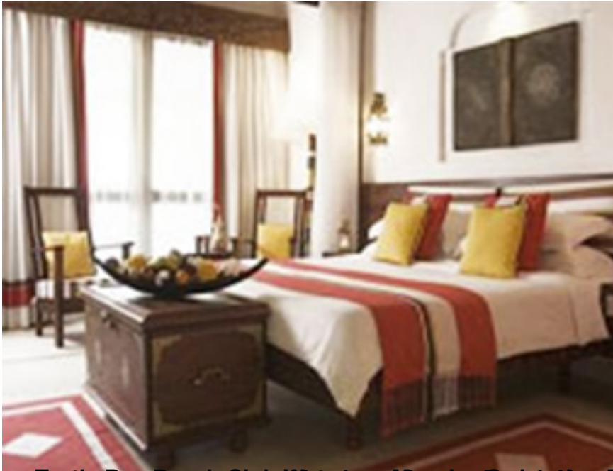
Me Turtle Bay Beach Club, Waterpark, Spa, Swimming Pool, Spa Room X 2.50 (includes breakfast, parking, and access to all amenities) 11pm midnights